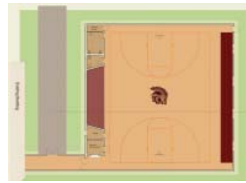
Elementary PE Building