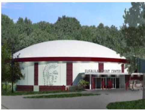
Eufaula Event Center