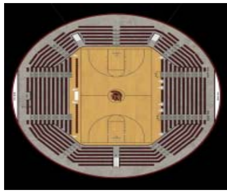
Eufaula Event Center Seating